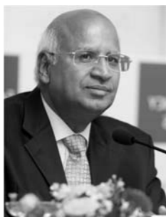
Mr. Subramanam Ramadorai Vice Chairman, Tata Consultancy Services

Mr. S. Ramadorai graduated in Physics from Delhi University. He holds a Bachelor of Engineering degree in Electronics and Telecommunications from the Institute of Science, Bangalore, and a Master's degree in Computer Science from the University of California, Los Angeles. In 1993, Mr. Ramadorai attended the Sloan School of Management's highly acclaimed Senior Executive Development Programme.